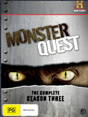
MONSTER QUEST (2007-) History Channel