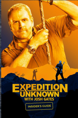
EXPEDITION UNKNOWN (2015-) Travel Channel