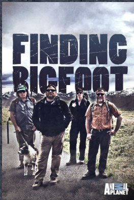
FINDING BIGFOOT (2011-2018) Animal Planet