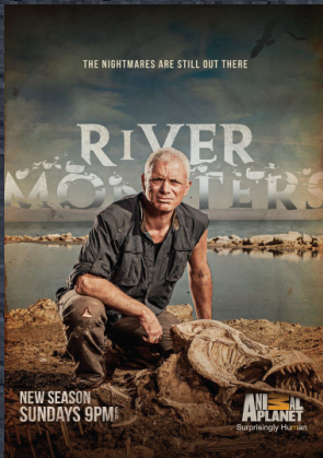
RIVER MONSTERS (2009-2017) Discovery Channel / Animal Planet